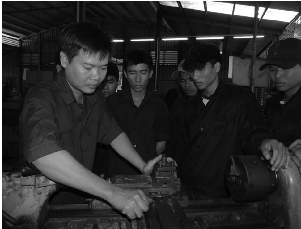
Students use machinery during a lesson at Cần Thơ University in the southern province of Cần Thơ.

To build schools in the 2014-2015 year, for example, only Tân Phú Đông District in Tiền Gi-